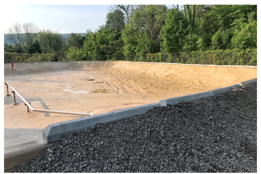
American Coating Technologies was contacted by an engineer for the firm of Brinners & Lorios who represented Heritagenergy. The Heritagenergy facility in Wawarsing, NY had a recent inspection from the New York State Department of Environmental Conservation. They had tested the existing clay liner system and it no longer met the requirements for secondary containment of petroleum products.